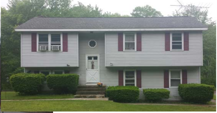
Two Family house