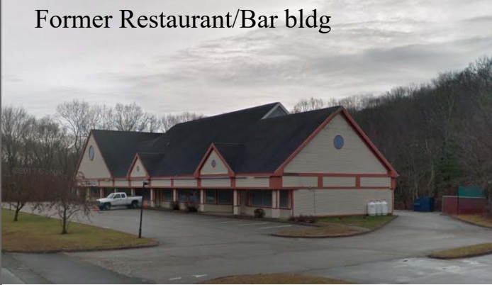
Former Restaurant/Bar bldg