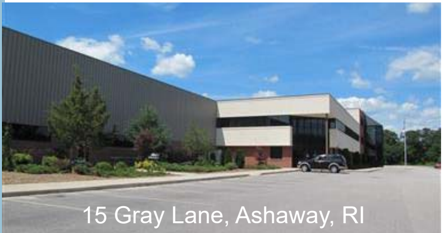
15 Gray Lane, Ashaway, RI